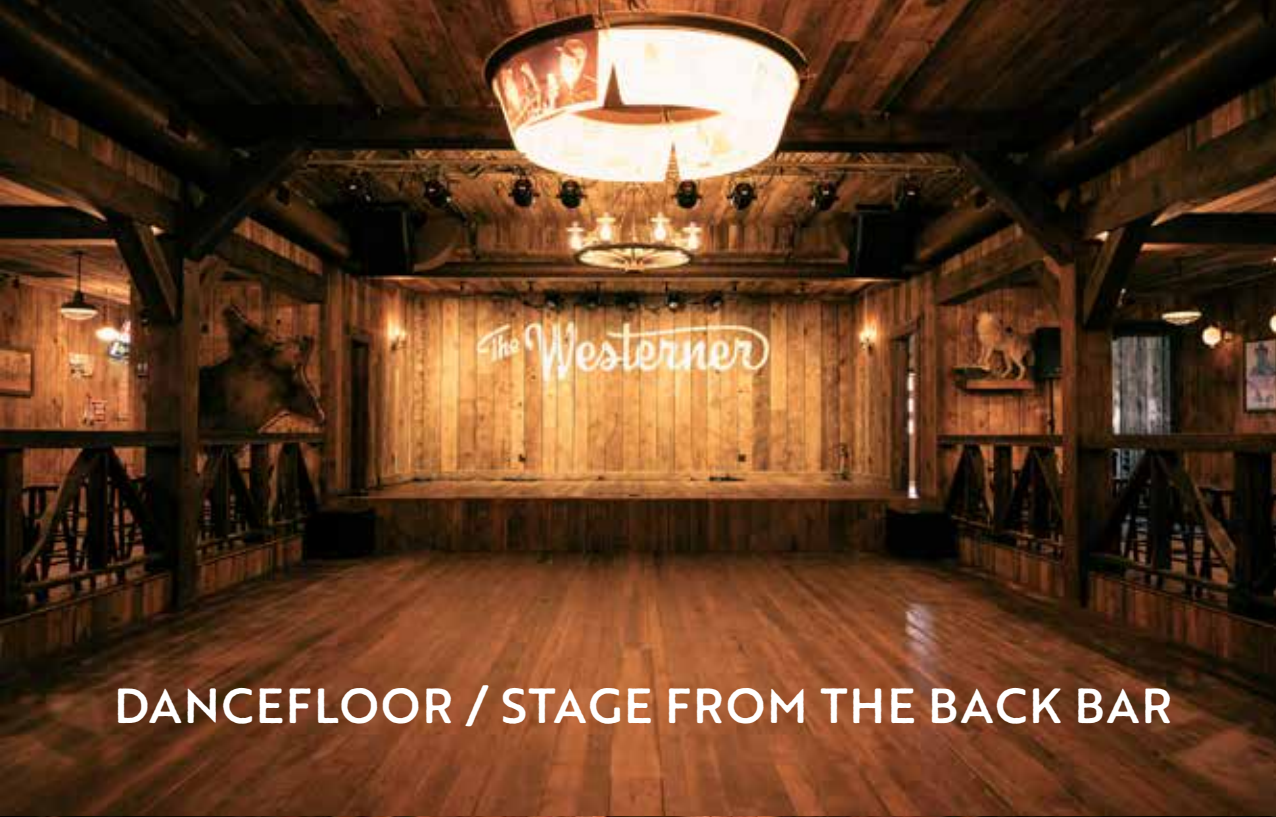
DANCEFLOOR / STAGE FROM THE BACK BAR