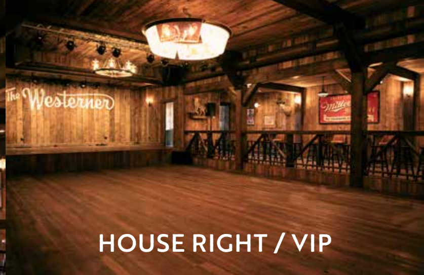
HOUSE RIGHT / VIP