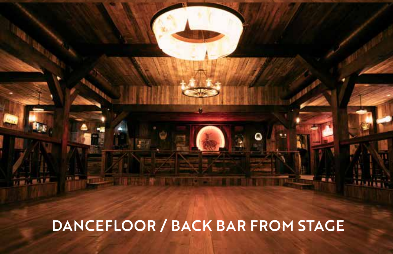
DANCEFLOOR / BACK BAR FROM STAGE